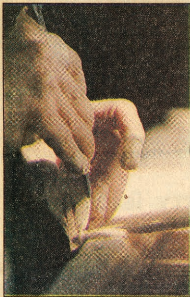
▲ Skilled hands file down piano hammers.